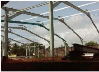
Sonic steel pvt ltd Dankotuwa industrial estate