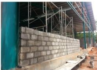
Kurunegala project – wayaba distributors (hemass legists)

For More New Projects log on to www.inuraconstruction.com