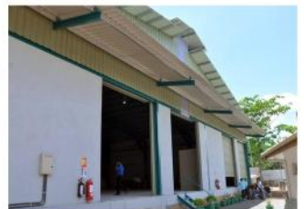
Kurunegala project – Hemas Logistics Double Hieght Warehouse